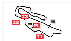
Autodromo Internazionale del Mugello 5245 m.