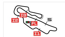
Autodromo Internazionale del 5245 m. Mugello